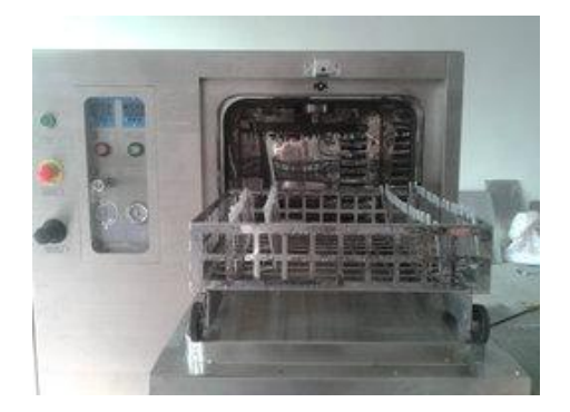
Cleaning room(Stainless steel304)