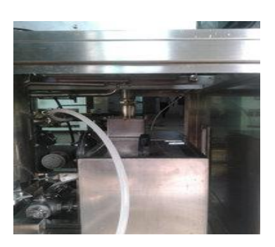
Liquid box Made by I.C.T