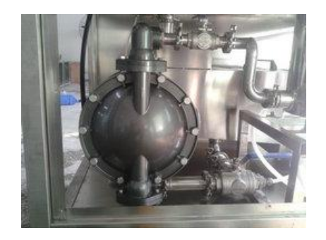
Pipe and Valve Stainless steel304